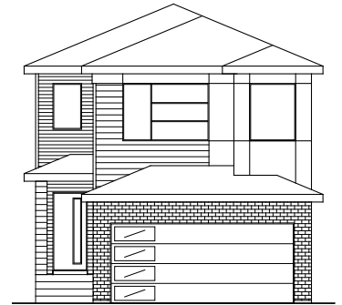
TRADITIONAL FARMHOUSE - SECOND